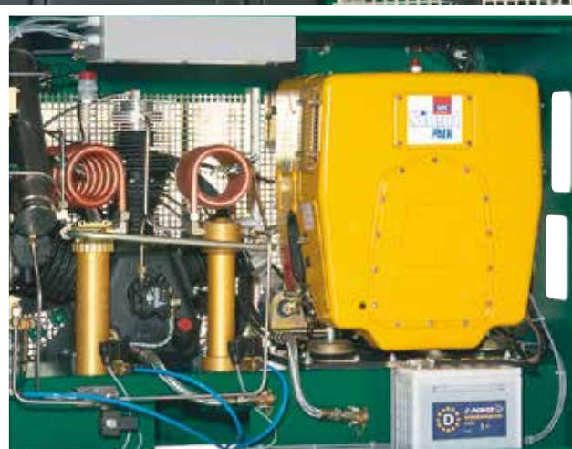
LW 450 D Rear view