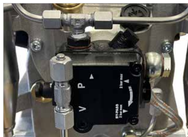
NEW - Adjustable oil pump with oil sieve